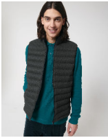
Stanley Climber Wool-Like

Shell : Plain Weave Brushed , 100% Polyester - Recycled , Fluorine-free DWR , 140 GSM